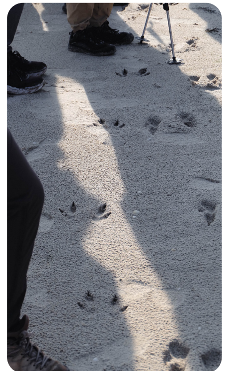
Above left: exposed midden on banks of Shallow Inlet; right: wallaby footprints at Shallow Inlet