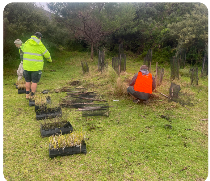
Clockwise from top left: industrious volunteers at the tree planting