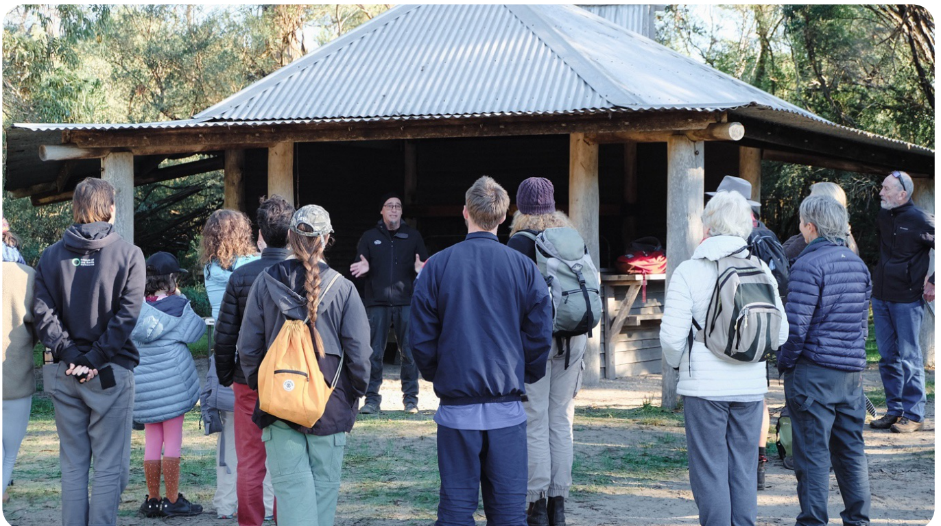
Above: Clinton addressing FOTP members at Stockyard Picnic area

A bull roarer is another way to communicate with mob. Other items included cutting stones, which were used to scrape flesh from possum skins to make possum skin or kangaroo skin cloaks.