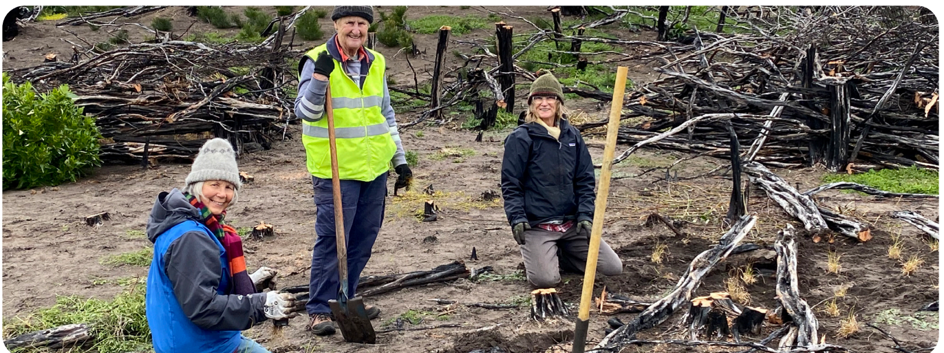
Clockwise from top left: