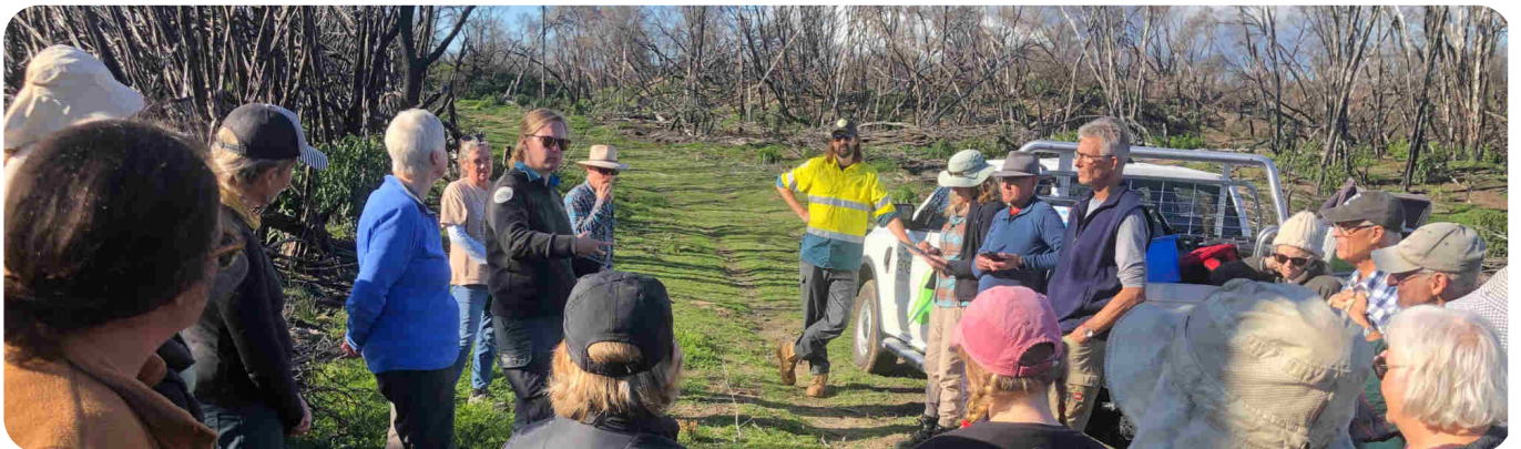
Clockwise from top left: Final lunch at Varney's grasslands, May 2025; volunteers check out regrowth on the new Sou' West Track project; brooke briefing volunteers at the Sou' West Track burn area