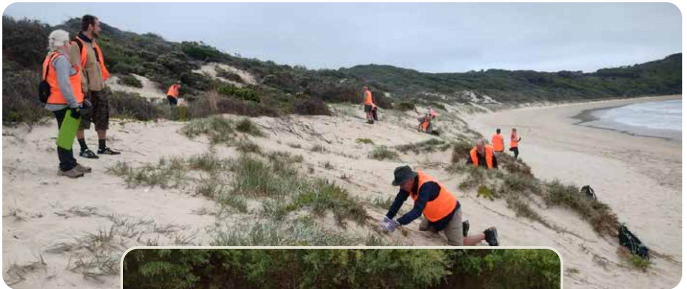
Below: Volunteers weeding in the dunes at Picnic Bay; Google Earth location of weeding areas