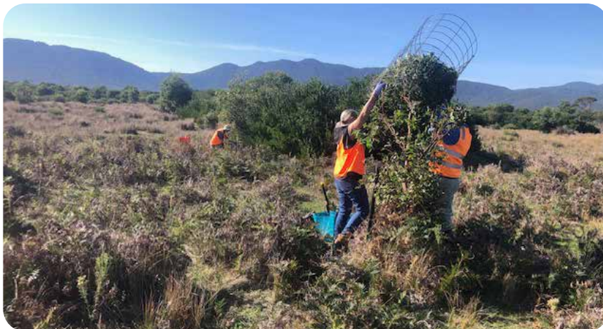
Below: Tree guard removal team