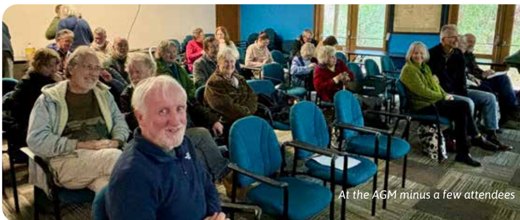
At the AGM minus a few attendees