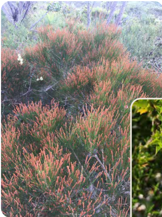
Photos clockwise from top left: Dwarf She-oak, typical heathland plants, Heathy Tea-tree, Pink Heath, Orchids

Heathlands at the Prom exist on infertile soils and are dominated by low hardy shrubs such as Heathy Tea-tree ( Gaudium myrsinoides ) and Dwarf She-oak ( Allocasuarina pusilla ).