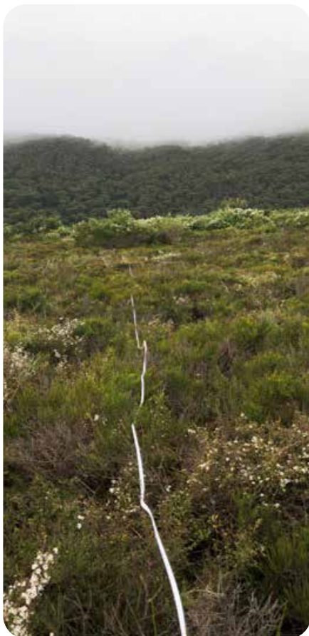
Left: Typical heathland transect, middle: sand heathland, right: transect through thick Tea-Tree

And finally, Mads has been inspired by their work at the Prom to continue on to a master's degree which will address some unanswered questions on the invasion of the Prom's valuable heathlands.