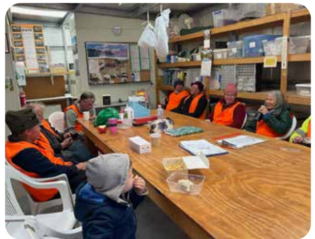
Volunteers being briefed by Cam and gathering for information and respite inside and out