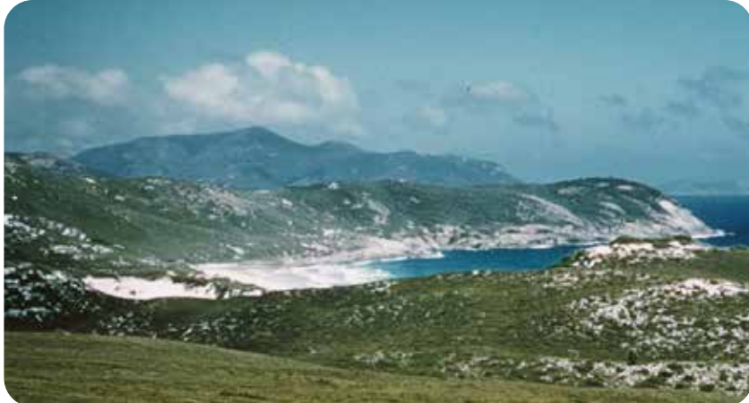
Above: Norman Bay Lookout 1960 Below: Norman Bay Lookout 2023